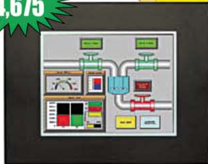
10" TFT Colour Outdoor Readable

Note: The specifications of the EZSeries brighter Touchpanels are identical to the standard EZSeries except for the level of Brightness.