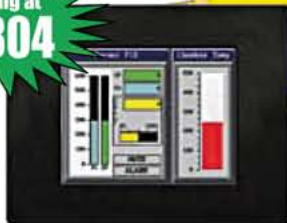
6" TFT Colour Outdoor Readable