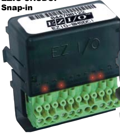
Terminal Block 300 Volt/10 Amp/ 14AWG UL Rating